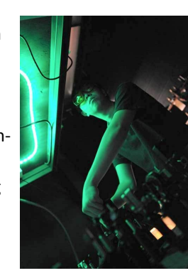
Young Ho Shin aligns a photon detector

Students who major in physics gain a broad-based training in science, develop an analytical and creative approach to problem-solving, and become adept at dealing with mathematical models. This training makes them adaptable to changing situations and is good preparation for a variety of challenging and interesting careers, many of which cross outside the bounds of what you might think of as "physics."